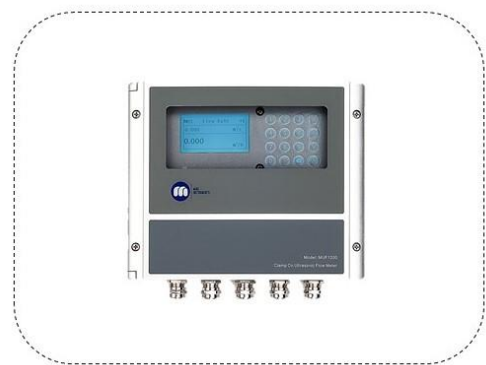
MUF 1200 (0.5%) Clamp On Ultrasonic Flow/BTU Meter

For assessing the performance and efficiency of fluid systems, the MUF 1200/MUF(B) 1200 Clamp on Transit Time Ultrasonic Flow/Btu Meter delivers unmatched accuracy. Whether it's evaluating the effectiveness of pumps or monitoring regulating valves, this meter provides comprehensive insights. Its ability to measure both flow and thermal energy facilitates thorough performance assessments, enabling proactive maintenance and optimization strategies.